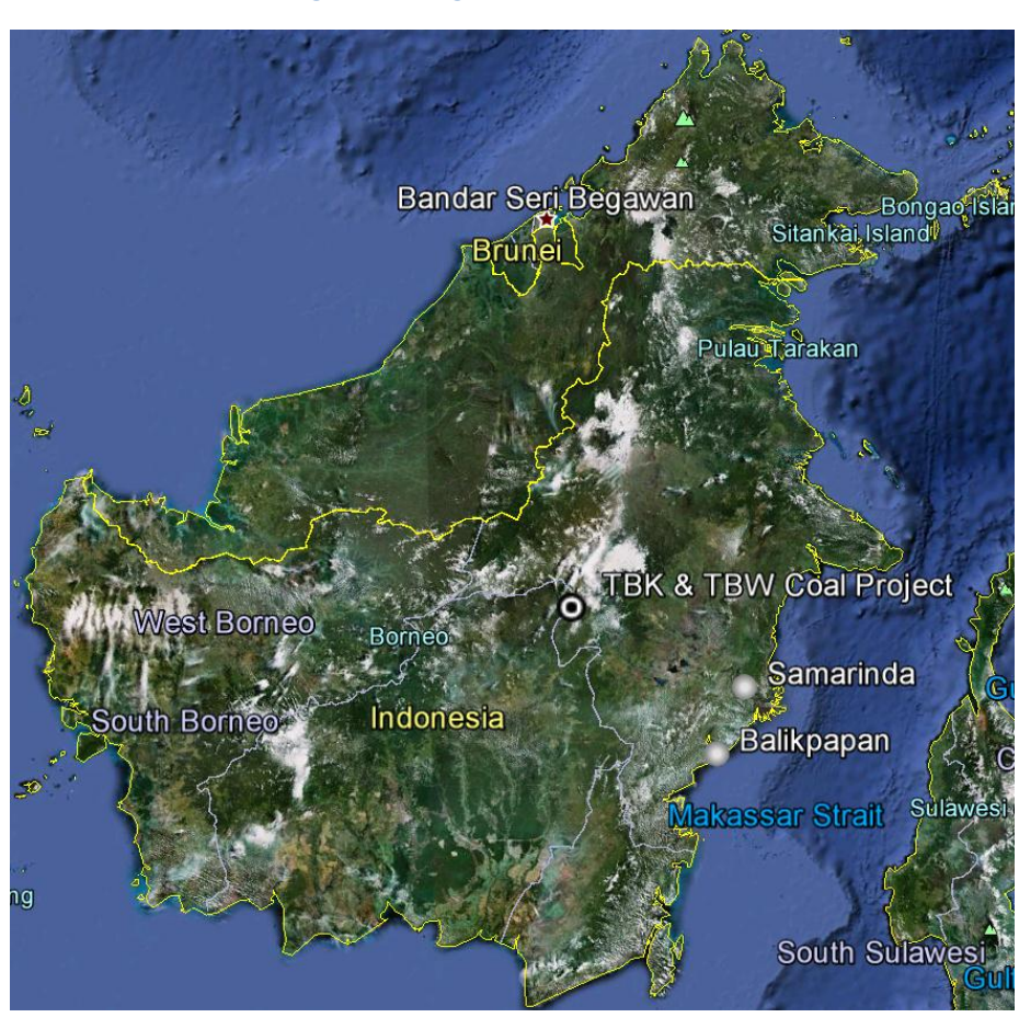
Figure 1: Regional Location Map

The Indonesian part of the island is divided into 4 provinces – East Kalimantan, West Kalimantan, Central Kalimantan and South Kalimantan.